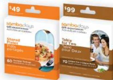
For the Foodie